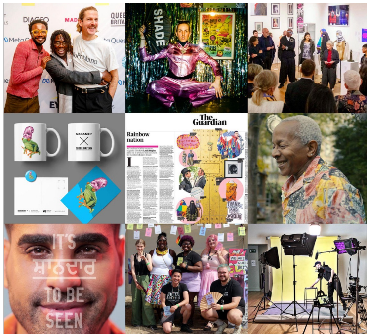
IMAGES EVENTS AND PROJECTS AT QUEER BRITAIN

We welcome an average of 30,000 visitors each year, telling unheard LGBTQ+ stories, from a LGBTQ+ perspective.